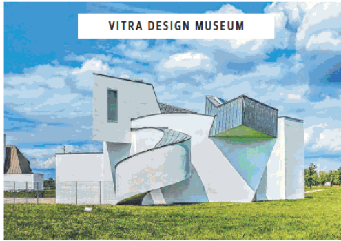
VITRA DESIGN MUSEUM

In my ears, architect Albert Gothe is explaining how the original bathhouse design by Herzog & de Meuron came out of an architecture competition in 1979, but it was not opened until 2014. During the 35 years in between, the public had abandoned the idea of conventional swimming pools. Inside today, the pool is biologically purified in a natural way using water plants and layers of gravel, sand and soil.