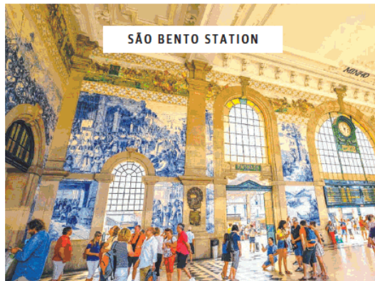
SÃO BENTO STATION

Let experts take you into secret streets full of sherbet facades and crumbling charm (above left); and enthusiastic local guides will reveal the stories behind detailed paintings inside São Bento railway station.