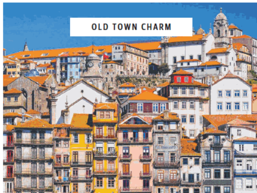
OLD TOWN CHARM